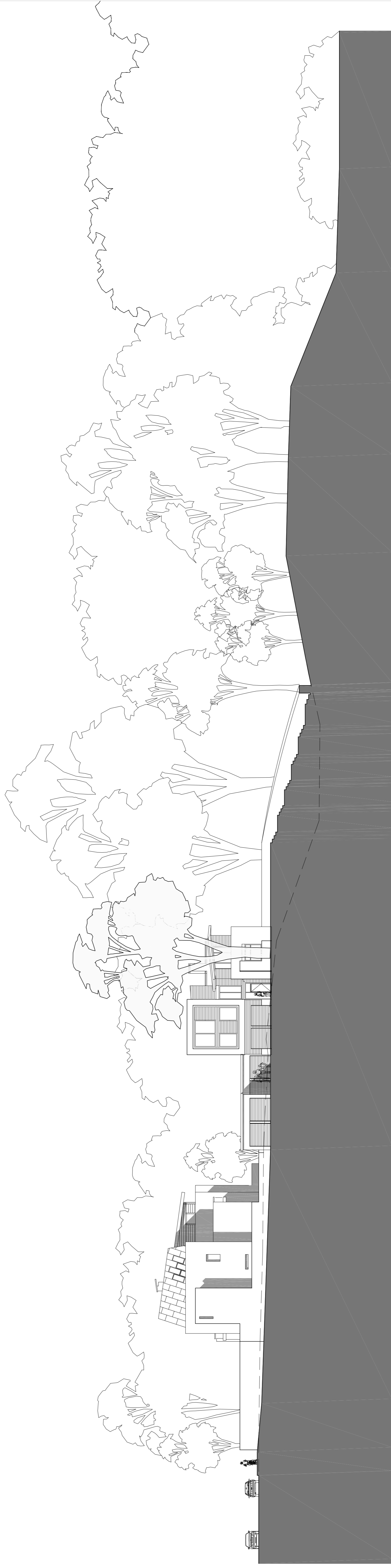
PROPOSED SECTION A - A SCALE 1:1250